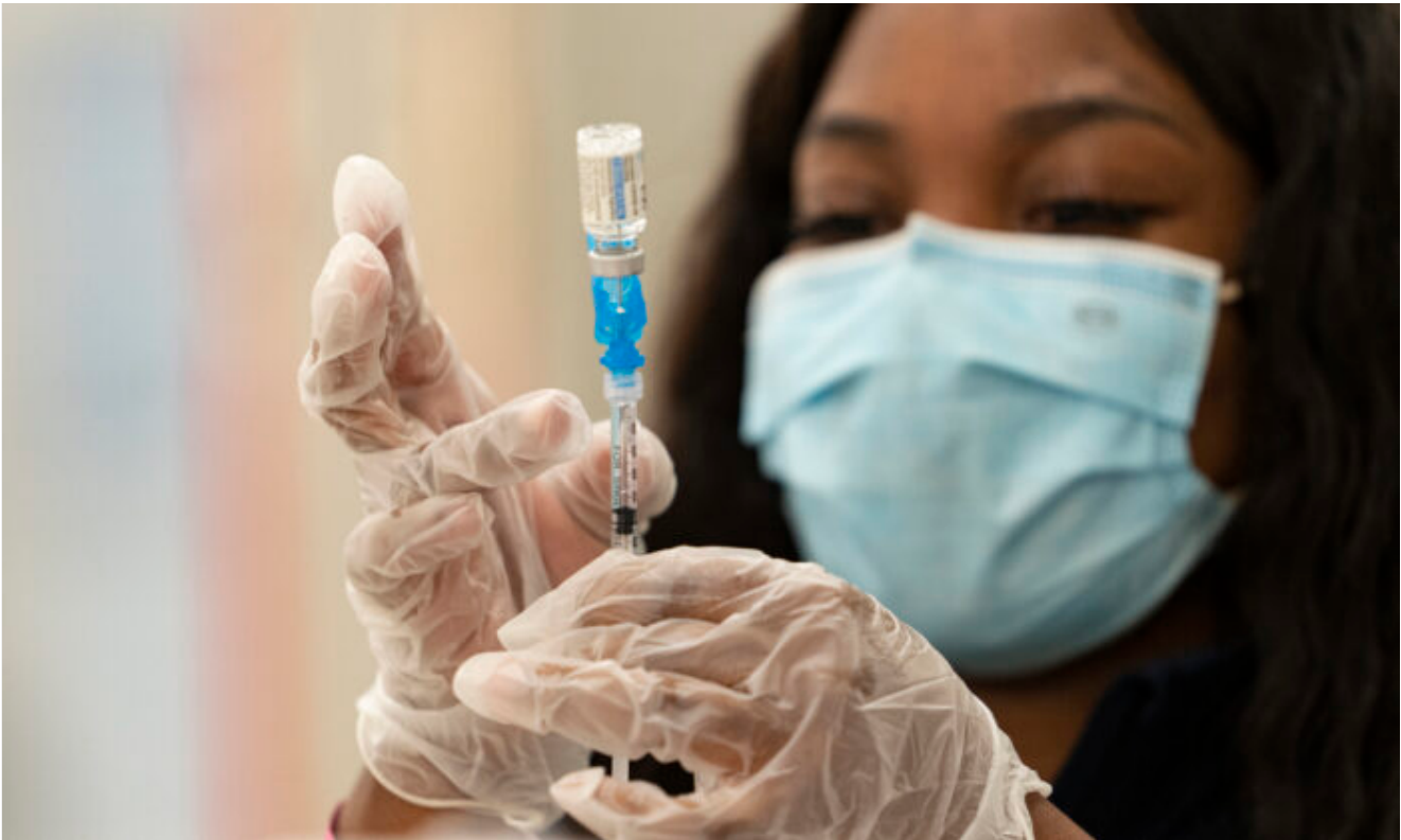
A health worker loads syringes with the vaccine on the first day of the Johnson & Johnson vaccine being made available to residents at the Baldwin Hills Crenshaw Plaza in Los Angeles, Calif., on March 11, 2021.