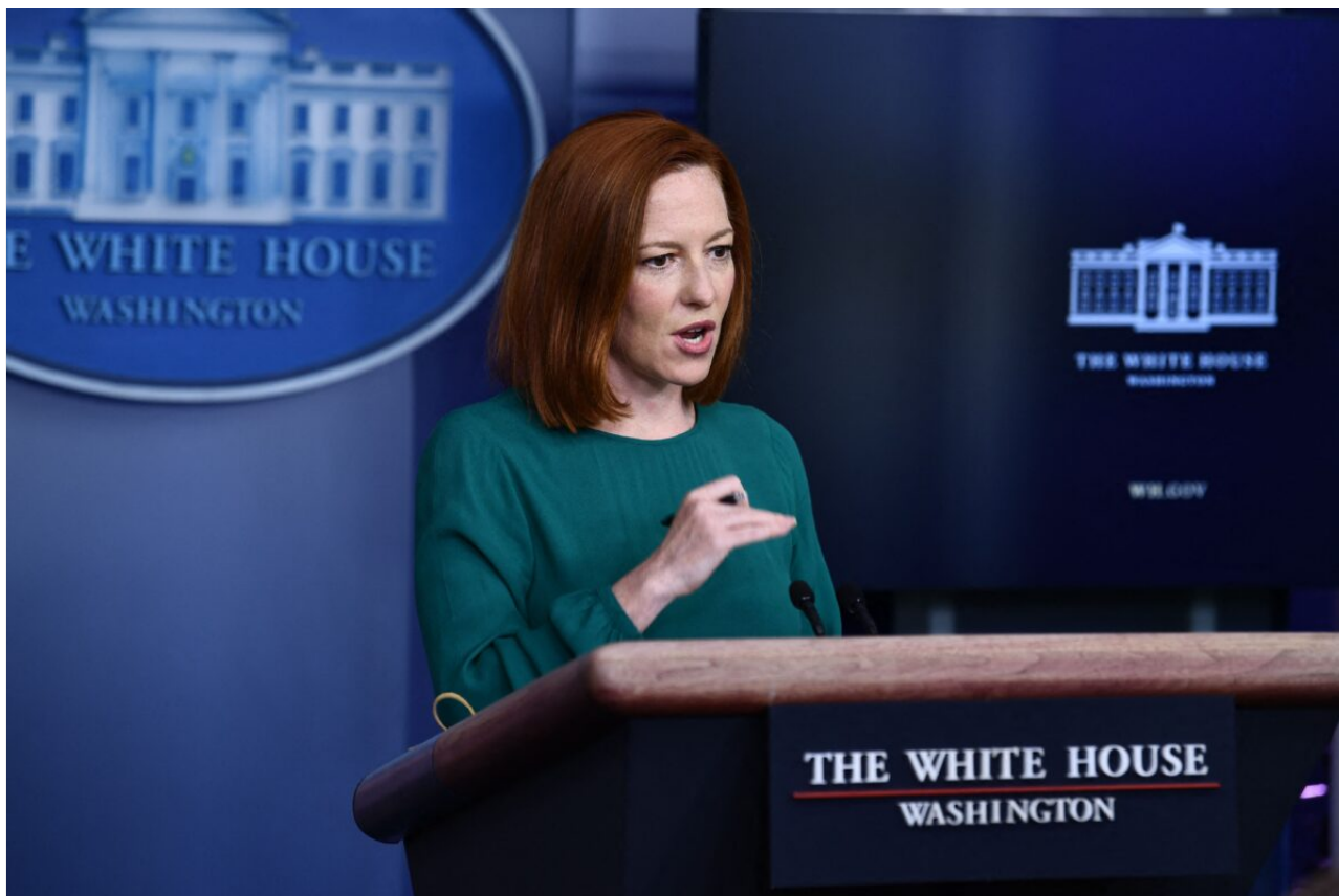
White House press secretary Jen Psaki speaks during the daily press briefing in the Brady Briefing Room of the White House in Washington on April 6, 2021.

Psaki last month responded to reports that the administration was working with private firms to create a passport system, saying the administration would only provide guidance.