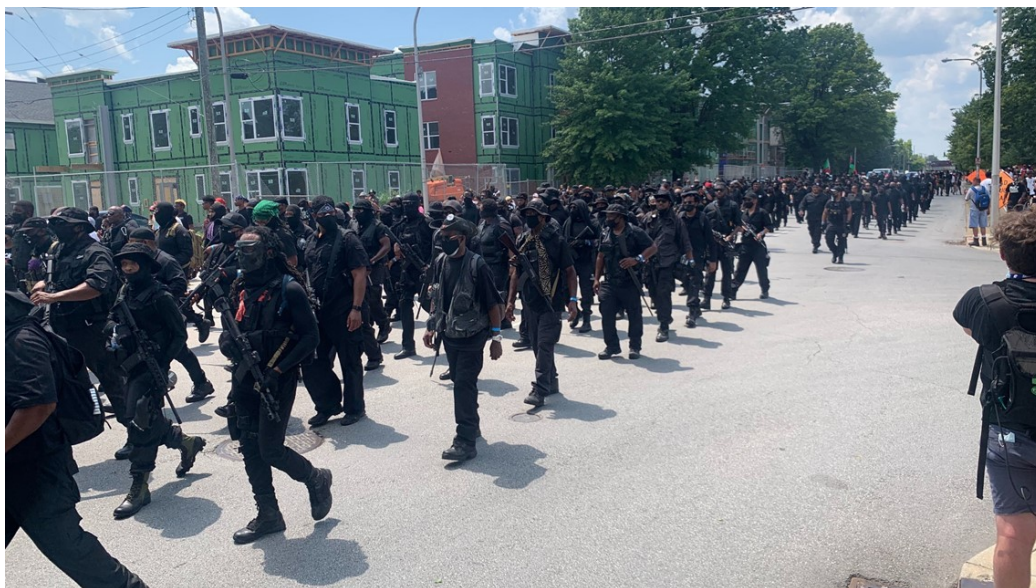
Louisville, heavily armed black militia march, 7-25-20