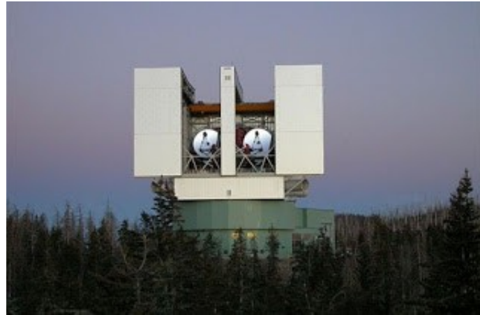
The Vatican's L.U.C.I.F.E.R. Telescope.

Much has been reported on UFO's and "space aliens," both by reputable media and by sci-fi pundits, that have made flying saucers their life's pursuit... some of the later with a bit of legitimacy. In any event, many Christian writers believe in a coming deception by "inter-dimensional" beings, not extraterrestrial, (demonic in mission) who/that will claim to be "returning" to their creation to fix its dismal condition. In such an event, I expect most will consider them to be extraterrestrial, and that they are much smarter than us and we need to work with them.